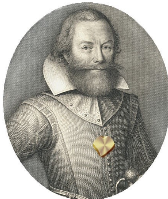
Captain John Smith

So off he went. Not to the lackluster battles of the Low Countries, but to where the real action was—in Southern Europe, being invaded by the Turks. His success there gave him his rank of Captain, a pension for life, and a coat of arms. His arms included three Turks heads, who he had killed in single combat. He was eventually captured, taken to Constantinople, and sold as a slave before escaping and making his way back to London. His next adventure ... Jamestown. But we know the story from there.