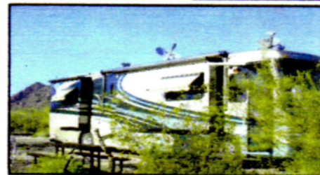
Home is where you park it!

*Only when we walk in the dark do we see the stars