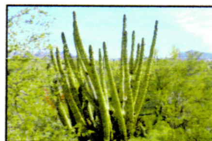
Organ Pipe Cactus