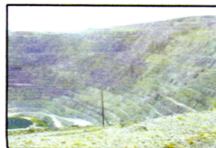
Open Pit Mine Ajo, AZ