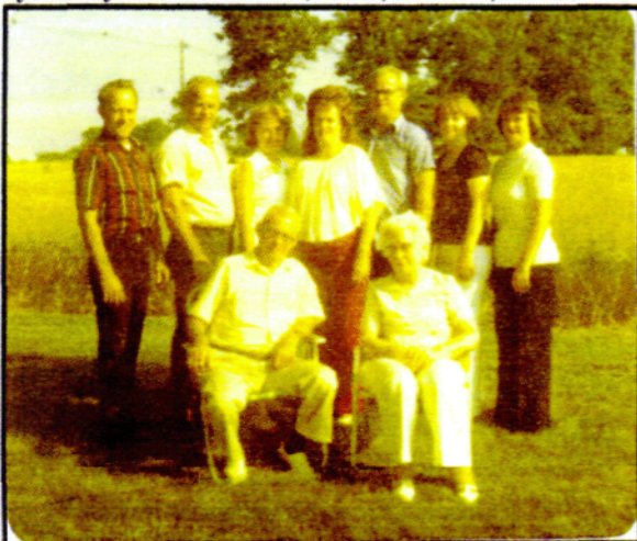
These pictures were taken in Smithon, IL in 1978 at our very first Farrar Family Reunion!