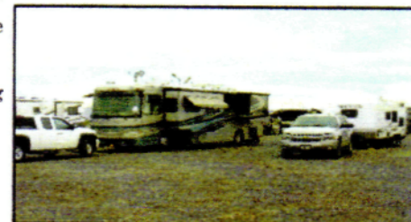
Our Desert Camp