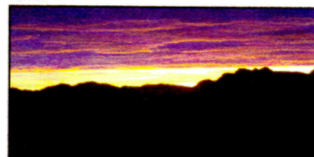
Sunrise at Quartzite