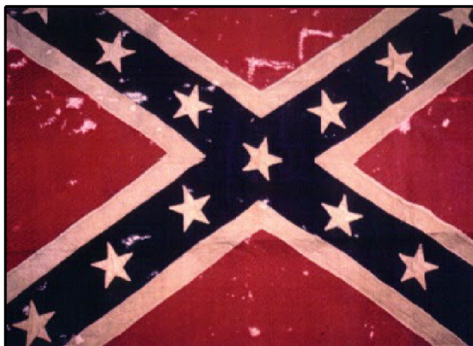
41st Tennessee Infantry Flag