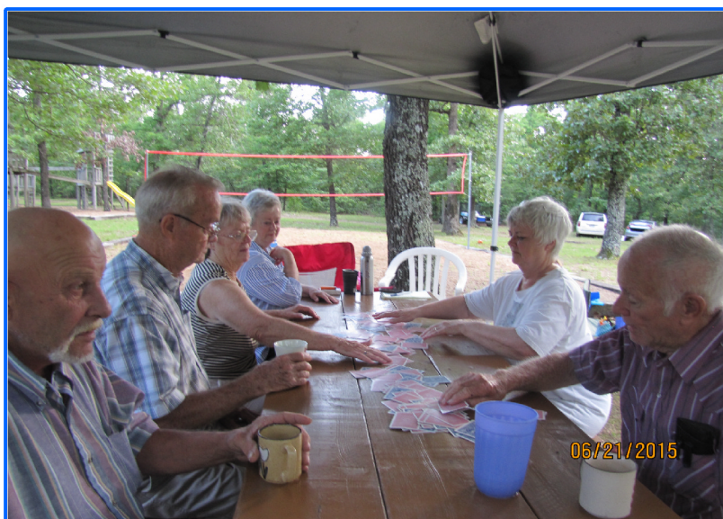
fun filled game of "Oh heck!"