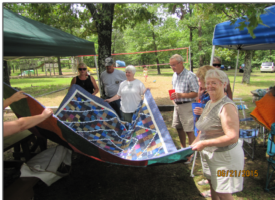
Showing off one of Aunt Jean's beautiful quilts