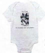
Infant Bodysuit $13.99