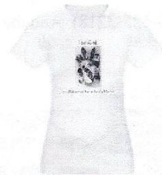
Jr. Jersey T-Shirt $19.99