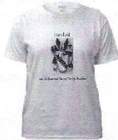
Women's T-Shirt $16.99