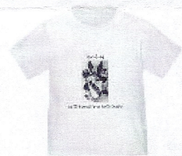
Toddler T-Shirt $9.99