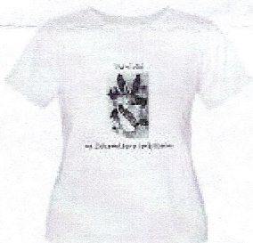
Women's Plus Size Scoop Neck T-Shirt $24.99