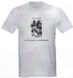
Light T-Shirt $15.99