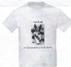
Kids Light T-Shirt $14.99