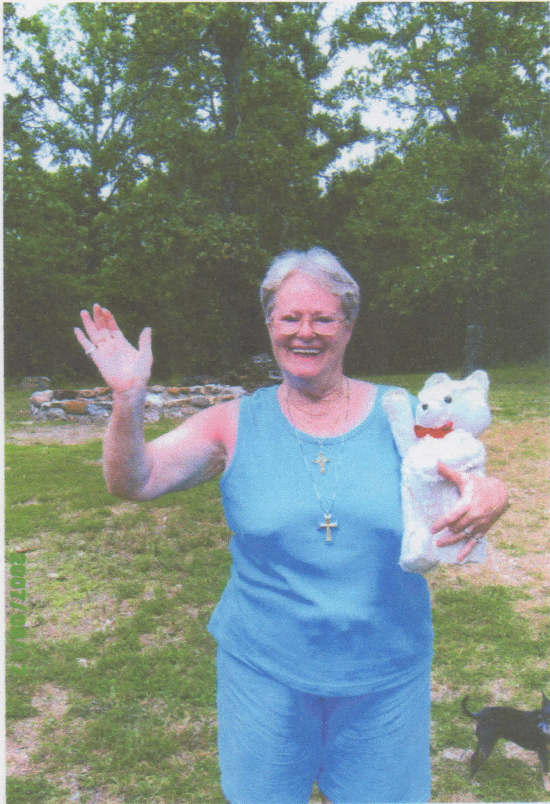
Farrar Reunion 2007