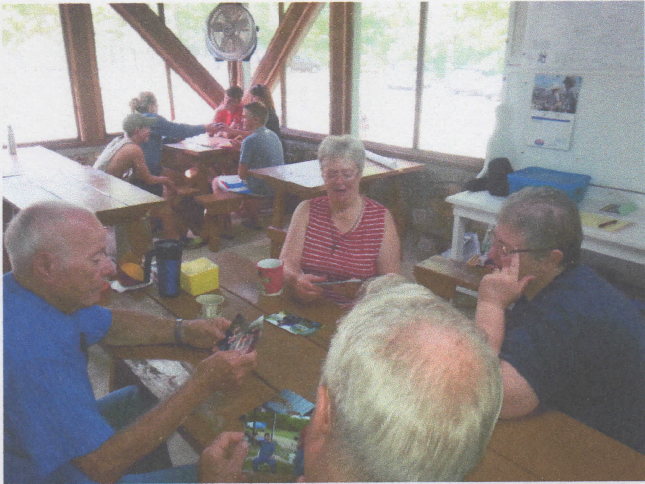
Card playing reunion 2014