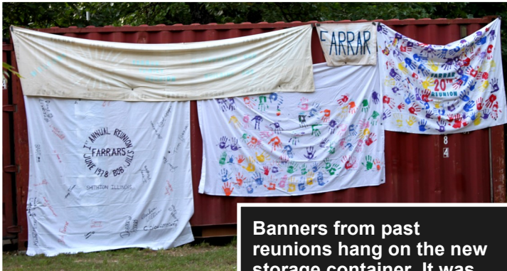
Banners from past reunions hang on the new storage container. It was fun to see who was at the first reunion and how much our handprints had changed since the 20th.