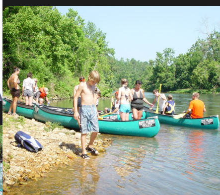
2009: Lunch Time