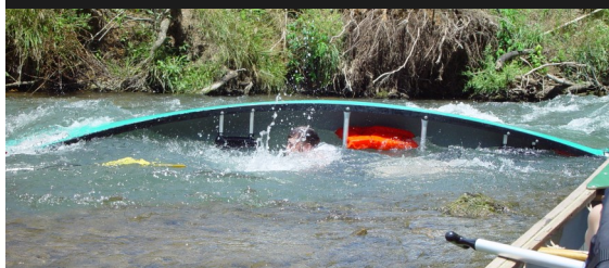
2007: Farrar Overboard!