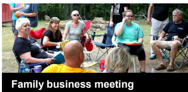
Family business meeting